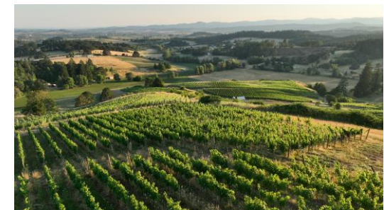
Bishop Creek Vineyard (planted 1988), Yamhill-Carlton