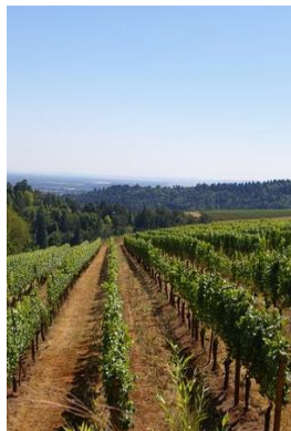
La Colina Vineyard

A beautiful light garnet color is the first indication of an ideal harvest and gentle winemaking approach for this variety. This stunning, glowing color holds fresh red cherry, black tea, chocolate and subtle pops of toasted clove and spice on the nose. The fruit is crunchy and snappy at this early stage, but a core of Christmas spice and anise arrive to inter-mingle with these cold-pressed red fruit elements as the wine begins to unwind. Alert acidity on the front-end gives way to silky tannins and an expansion of a plump roundness that juggles red bush fruits, citrus and milk chocolate that is alluring and highly stimulating to the senses.