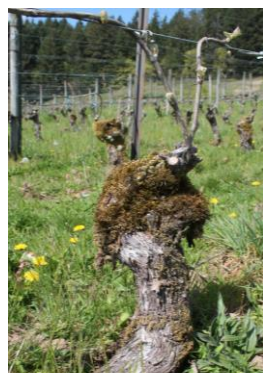
Bishop Creek Vineyard