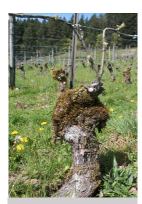
Bishop Creek Vineyard