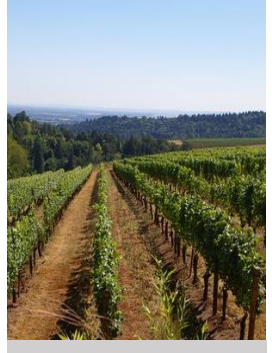
La Colina Vineyard