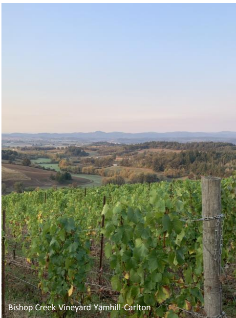
Bishop Creek Vineyard Yamhill-Carlton

Located in the Yamhill-Carlton AVA, the site features 13.5 planted acres, with 11 of those acres being four different clones of pinot noir. The majority of the pinot noir vines at Bishop Creek were planted in 1988 and 1990, and are own-rooted. The upper-bench of this famed site also contains our 1990's era Chardonnay plantings. At almost 750' elevation, these mountain-grown plants possess deep root systems by virtue of porous ancient marine sedimentary soils and produce exquisite wines with strong tension and character.