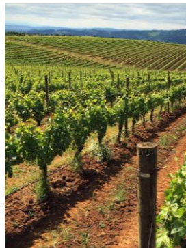
Temperance Hill Vineyard

Dark, rich color with slight brick edges. Explodes from the glass with ripe pomegranate, warm blackberry cobbler, leather and sandalwood aromas. Tannins immediately show a lovely sweetness and creaminess to them with a mid-palate of spicecake, cassis and berry liquor and a long, medium-bodied finish. This wine will continue to unfold over the next 2-3 years.