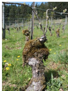
Bishop Creek Vineyard