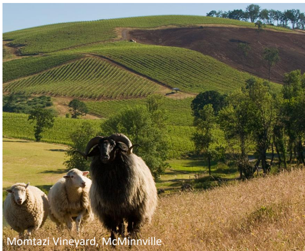
Momtazi Vineyard, McMinnville