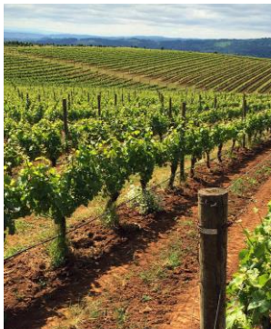
Temperance Hill Vineyard