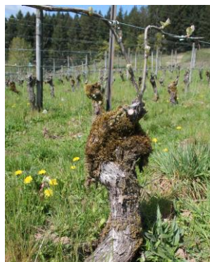
Bishop Creek Vineyard