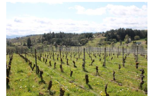
Bishop Creek Vineyard (planted 1988), Yamhill-Carlton