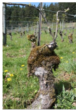
Bishop Creek Vineyard