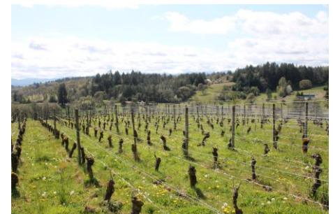
Bishop Creek Vineyard (planted 1988), Yamhill-Carlton