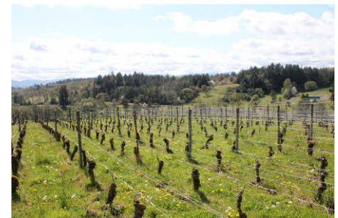
Bishop Creek Vineyard (planted 1988), Yamhill-Carlton